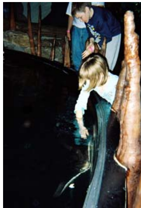
You can pet the stingrays and the baby sharks.