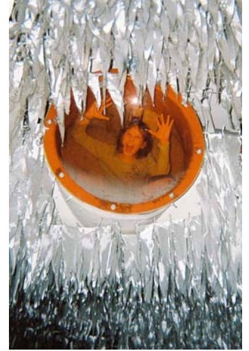
There are also logs, caves, and slides. Everywhere you turn, there is something to climb in, on, or through!